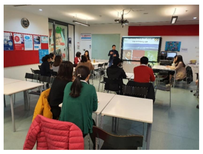
Officers attending the English language training

Three English language training sessions were delivered by IEI Hanoi to 21 officers from the Department of Immigration and Ministry of Public Security (MPSI). The participants had opportunities to learn about interpretation and memorisation skills, professional behaviour and communication. This has strengthened the relationship with MPSI and foster effective joint working.