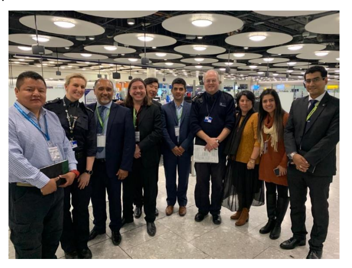
Delegates visiting UK Border Force

Following the success of the regional forgery conference hosted in Bogota in January 2019, IEI Bogota consolidated those relationships by again hosting delegates from seven ODA eligible countries with direct flights to the UK to discuss document forgery and forgery trends, in the UK. The delegates and an Immigration Liaison Officer (ILO) flew to London for a week. The conference focussed on sharing and developing capabilities for countering Modern Slavery and Human Trafficking (MSHT) and investigating Organised Immigration Crime. The delegates also visited the National Document Fraud Unit, the Metropolitan Police and Border Force.