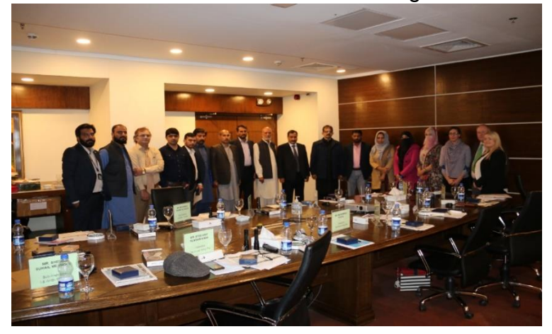
Delegates following the training

IEI Islamabad successfully closed the financial year with completion and delivery of an Advanced Forgery course to the Federal Investigation Agency (FIA) by NDFU colleagues from the UK. The delegates were represented from across the country and from Ports, Investigation teams and the Technical wing. There was also good representation of female delegates furthering equality and diversity in what is otherwise a male dominated service. Officers were able to share their experiences and knowledge in an open forum. The course included counterfeiting, image substitution and culminated in a practical exam at the end to which all the delegates passed. All delegates were issued with UV torches and magnifiers.