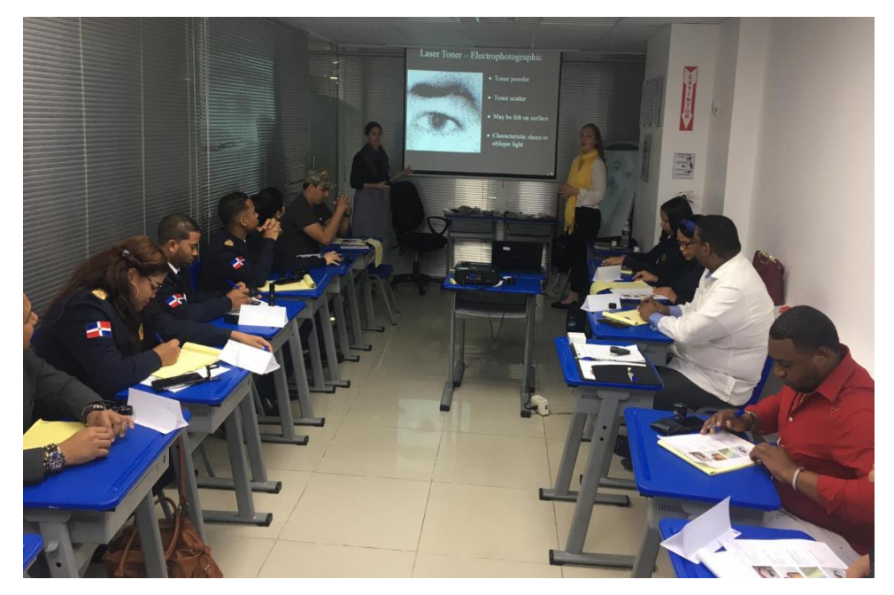
NDFU Training in Santo Domingo, Dominican Republic

The training covered many operational and management grades but was most successful at bringing our high value patterns form the region together in one place for the first time. The forgery training in in Santo Domingo was the first where IEI have been able to engage with the immigration authorities there after many months of preparation.