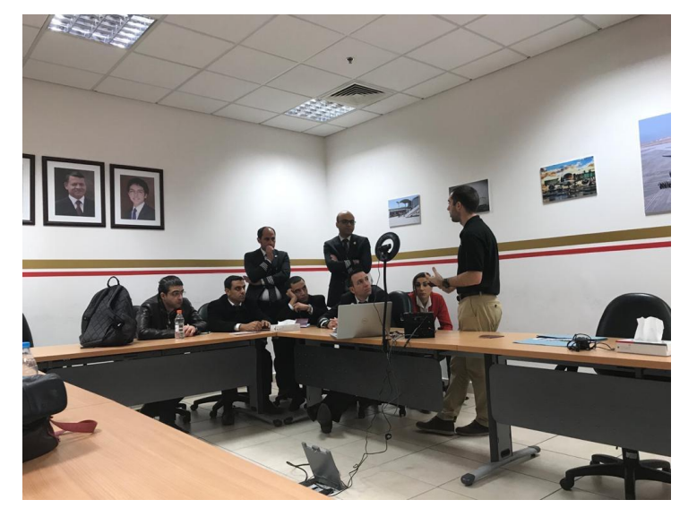
Royal Jordanian Airways Crew at the RJ Training centre QAIA Amman

Training was delivered by Foster & Freeman, manufacturers of the equipment at Queen Alia International Airport (QAIA) Amman and King Hussein International Airport (KHIA) Aqaba.