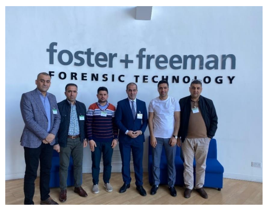
Iraqi Immigration Officers following their training

In March, IEI Amman facilitated a 5 day training course in the UK for a team of 5 Iraqi Immigration Officers and a Kurdish British interpreter. Iraqi counterparts were selected to train as 'super users' on specialist forgery equipment to further develop their forgery detection skills.