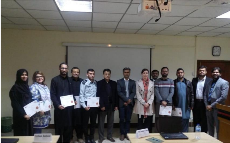
Delegates with their certificates

A pilot IT Microsoft essentials course was delivered to Federal Investigation officers across 10 sessions to support the procurement of IT systems which IEI had provided. The aim of the course was to raise the skill level of the FIA officials in using standard MS Office applications to a fundamental level of expertise. This will increase the information technology skills of the officials and will enable them to perform their day to day official computer work more quickly and effectively. The training was designed to support and introduce IT gradually into the workplace and reduce the paper based system. Emails and excel documents are now being used for regular communications and recording information.