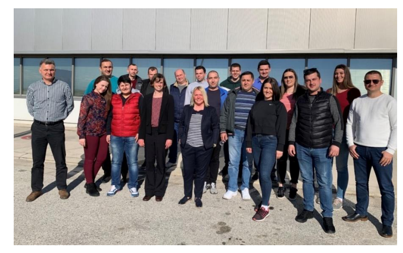
Police Officers following the training

In addition to the standard document abuse topics, at the delegates' request two sessions focussed on the local issues of Albanians using Italian and Greek documents. At the end of the course, the delegates were each gifted a magnifier with an integrated light source and presented with a certificate.