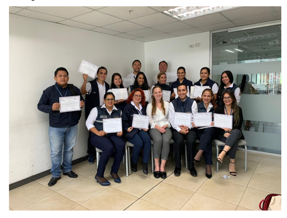
Immigration Officials with their certificates

IEI Bogota delivered capacity building training to 70 immigration officials. Focus was on areas such as document security characteristics, imposters and profiling. The trip also served to strengthen relations with the Ecuadorian authorities.